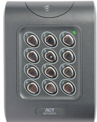
Product Code ACTpro MF 1050e Surface/Flush Mount PIN & Proximity Reader