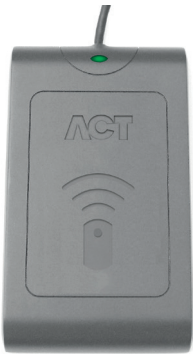
Product Code ACTpro USB Reader USB MIFARE Reader