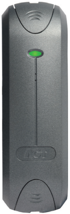
Product Code ACTpro MF 1030e Mullion Proximity Reader

1030e, 1030PM, 1040e, 1050e & USB Reader