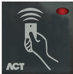
Product Code ACTpro MF 1030PM Panel Mount Proximity Reader