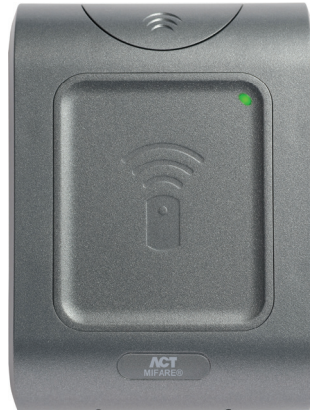
Product Code ACTpro MF 1040e Surface/Flush Mount Proximity Reader