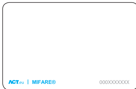
Product Code ACTpro MF Card MIFARE CARD