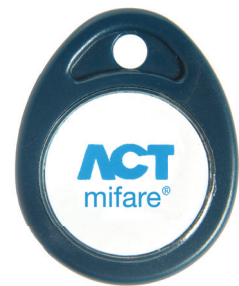
Product Code ACTpro MF Fob MIFARE FOB

All ACT products can be purchased through a network of distributors which can be found listed on the ACT.eu homepage.